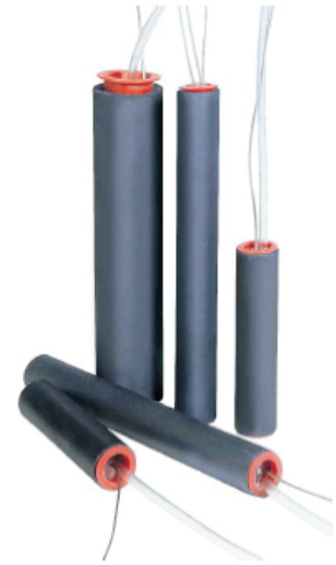
Ebonex® anodes with electrical connectors

Discrete Cathodic Protection Anodes for Reinforced Concrete Structures and Steel Framed Buildings